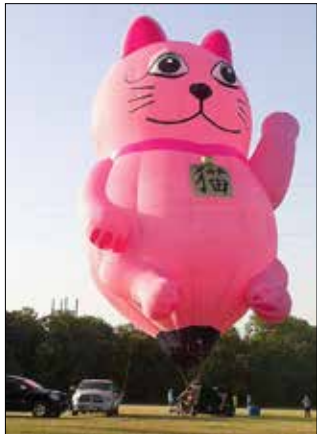
At Cross Point Camp in southern Oklahoma, a pink cat waves to children attending Camp Cavett while two more hot air balloons, below, rise to the occasion.