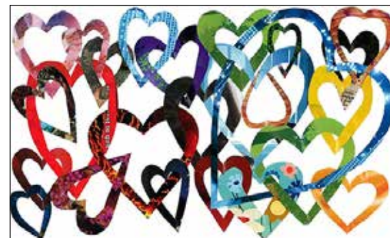
Artwork produced in a Holy C.O.W. class has been used in Wilburton's church bulletins and more.

These four churches complete the COC top-five list: Cheyenne Valley, Broken Arrow-First, Lucien, and Whitehead.