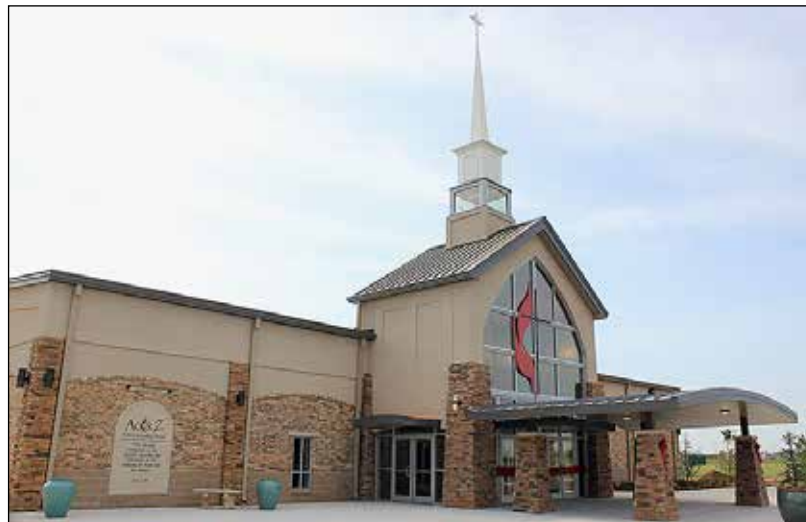
The project at Edmond-Acts 2 is due completion in a month.

A Bible was placed in the foundation when concrete was poured Nov. 13, 2013. The original sanctuary will become multi-purpose space. The church's parking and