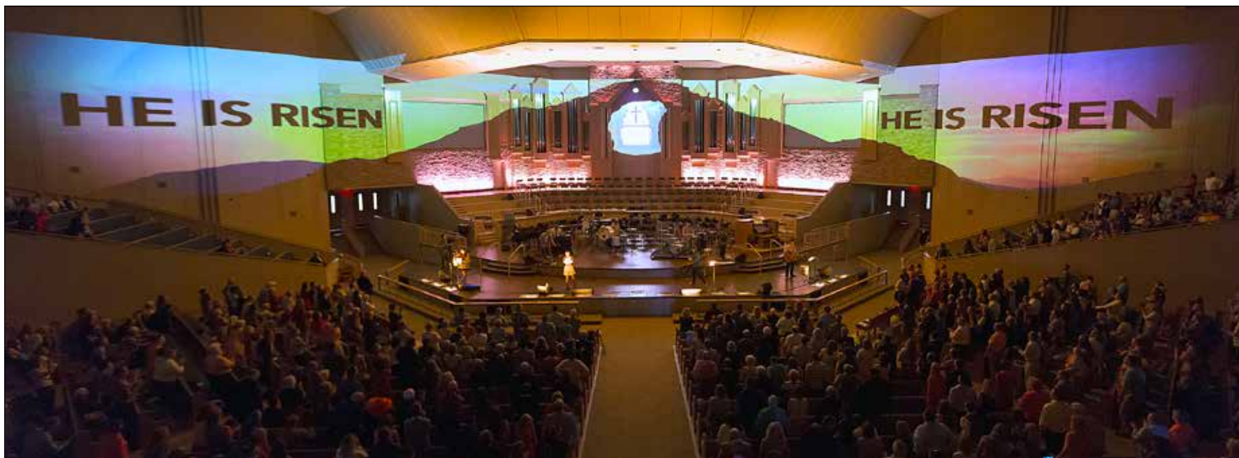
On Easter Sunday 2014, Tulsa-Asbury UMC proclaims Christ's resurrection through massive digital images on its walls. The scene is centered by a symbolic empty tomb.