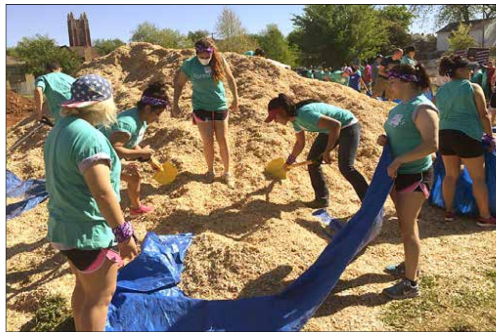
College students move a mountain of surfacing material for a playground.

a mile of the school. The volunteers transformed what had been just an open, grassy area where children played during recess.