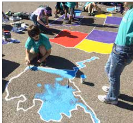
Volunteers paint a colorful U.S. map at Gatewood Elementary School.

Make reservations by 5 p.m. Sept. 1. The rally is free of charge. Contact Connie Barnett, cbarnett@okumc.org , 405-530-2006.