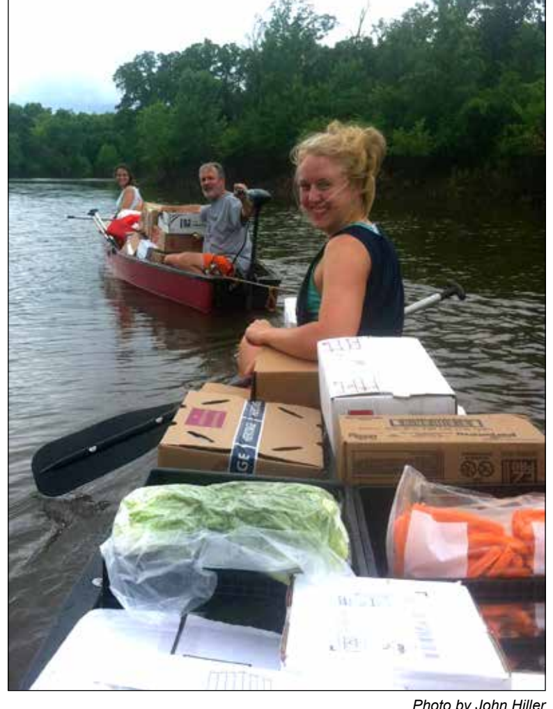
Cross Point Camp staff members move food supplies, delivered to water's edge by the Ben E. Keith Co., to the camp in mid-June.

access road was under at least 10 feet of water at the time, with only the tops of telephone poles showing