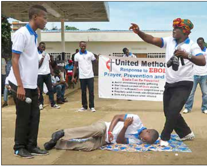
UM young adults in the Sierra Leone Annual Conference perform re-enactments to teach Ebola prevention and treatment in an area where people can't read or do not have access to radio.