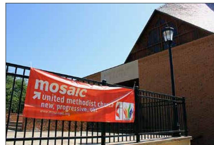
Mosaic UMC worships in OCU's Smith Chapel on Sunday mornings. The first service was June 7.