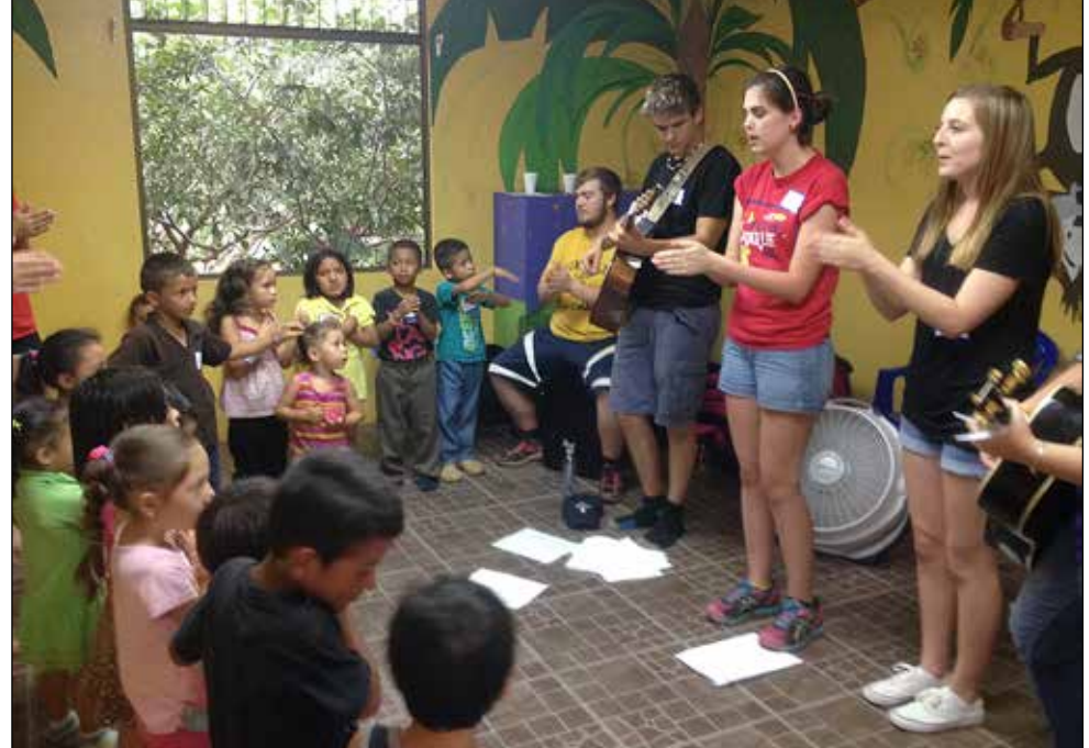
At a Methodist church in Costa Rica, Claremore-First Volunteers In Mission teach VBS songs, above, and build a perimeter fence, at left.

obey everything I have commanded you. And surely I am with you always, to the very end of the age."