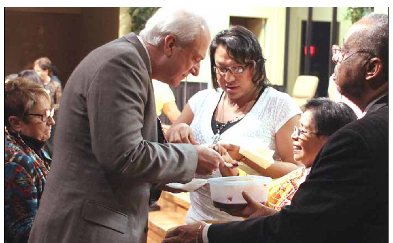
Bishop Thomas Bickerton of Pittsburg receives Communion during the Council of Bishops Act of Repentance on Nov. 6 at OKC-St. Luke's. The elements used were a Native American dish, grape dumplings.