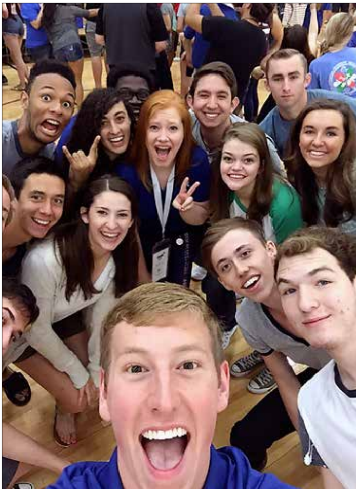
First-year students and orientation leaders participate in the selfie challenge during opening week events at Oklahoma City University.

Oklahoma City University welcomed the Class of 2019 with the annual matriculation service Aug. 19 and other events.