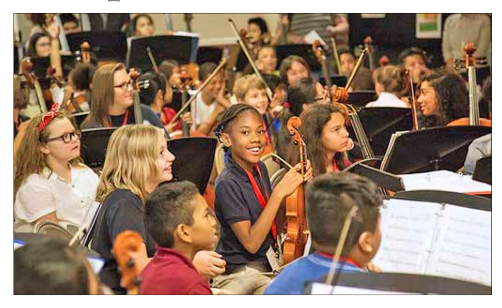
One girl's smile says it all as members of El Sistema, an after-school music program founded by OKC-St. Luke's, get ready to play.

joined El Sistema have answered God's call. She likes to say that when someone sees an opportunity and takes it, "that can't be odd. That has to be God."