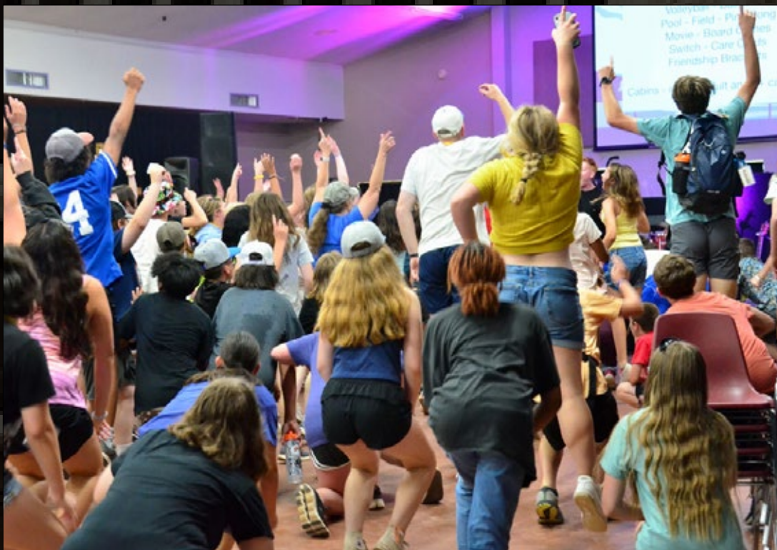
Campers worship during a past LEAD camp.

For more information on each scholarship opportunity and details on how to apply, please visit the website . We encourage all interested individuals to take advantage of these scholarships and join us for an unforgettable camping adventure in 2024. Let's make this season one to remember for everyone!