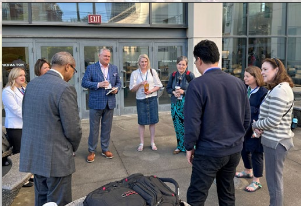
Oklahoma delegates meet together for prayer each morning outside of the food court at the Charlotte Convention Center at General Conference.

By end of day Tuesday of the second week, the Revised Social Principles legislation had largely been adopted. Of the six petitions that