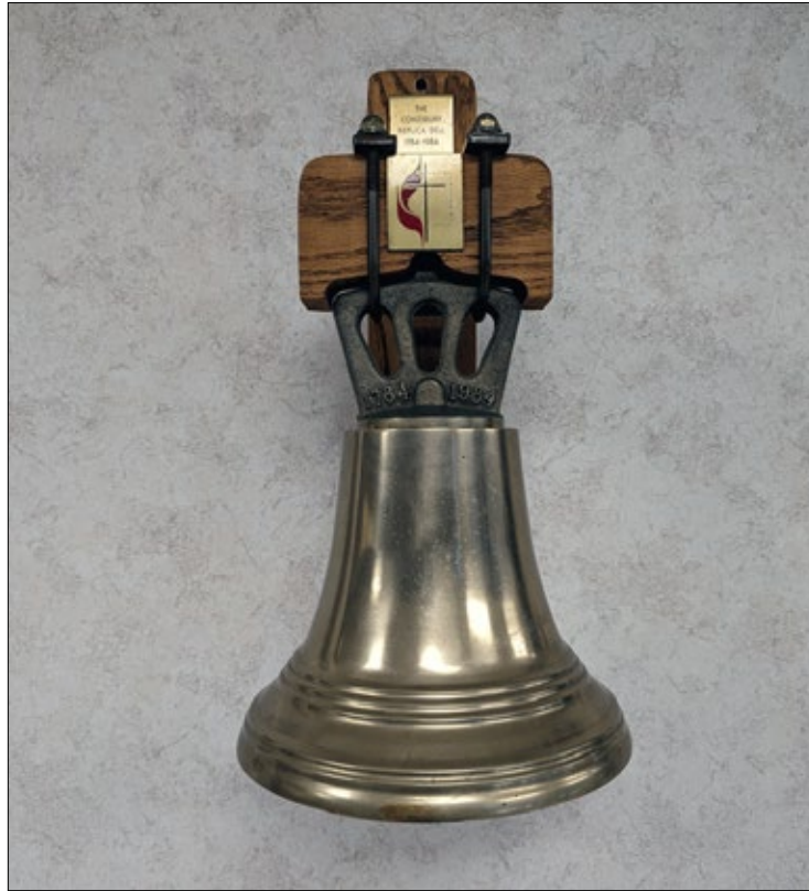
A replica of the original Cokesbury Bell donated by a closed church, on display at the conference office..

Our theme for this year's conference, "The World FOREVER Our Parish," was drawn from a John Wesley quote and Matthew 28:16-