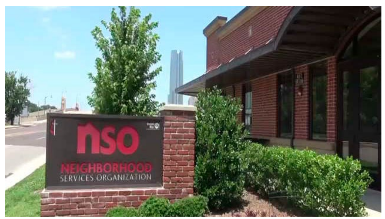
This video uses Adobe Flash Player. Click here to watch on YouTube.

The Contact will feature one of 14 Misison and Ministry ministries every month. A full list of OKUMC ministries is available at <a href="https://okumc.org/MissionAndMinistry">okumc.org/MissionAndMinistry</a>.